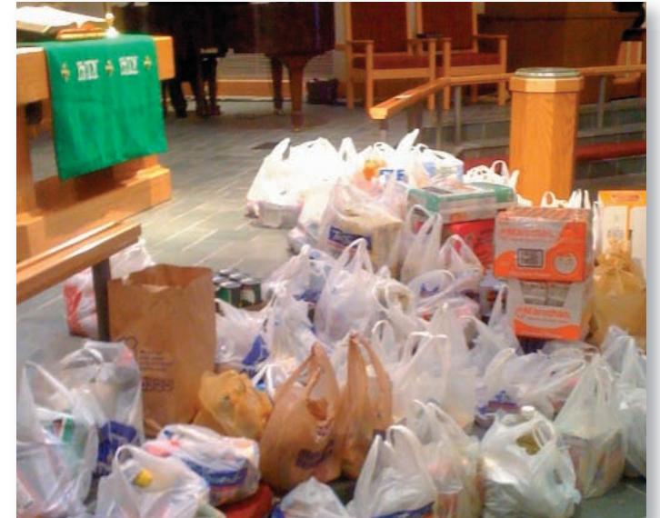
Food donations from the Traditional service gathered on the steps.