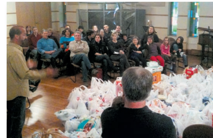
Combining donations from the Traditional service with those from the Contemporary service shows us what we can accomplish when we just "go and do."

for Africa, implementing an Early Emergency Response Team, collecting food for the Wilkinson Center monthly on Communion Sundays, and providing relief for Haiti.